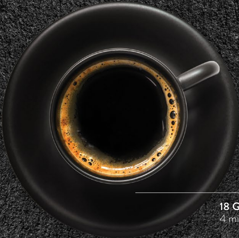
18 GRAMS ESPRESSO 4 minute walk