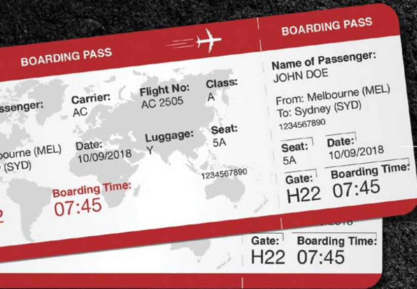
SYDNEY AIRPORT 20 minute drive