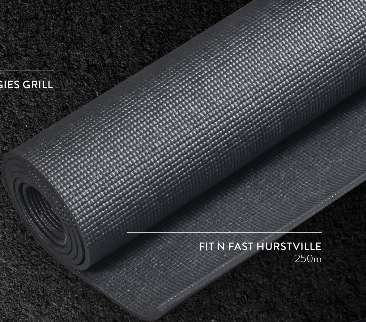
FIT N FAST HURSTVILLE 250m