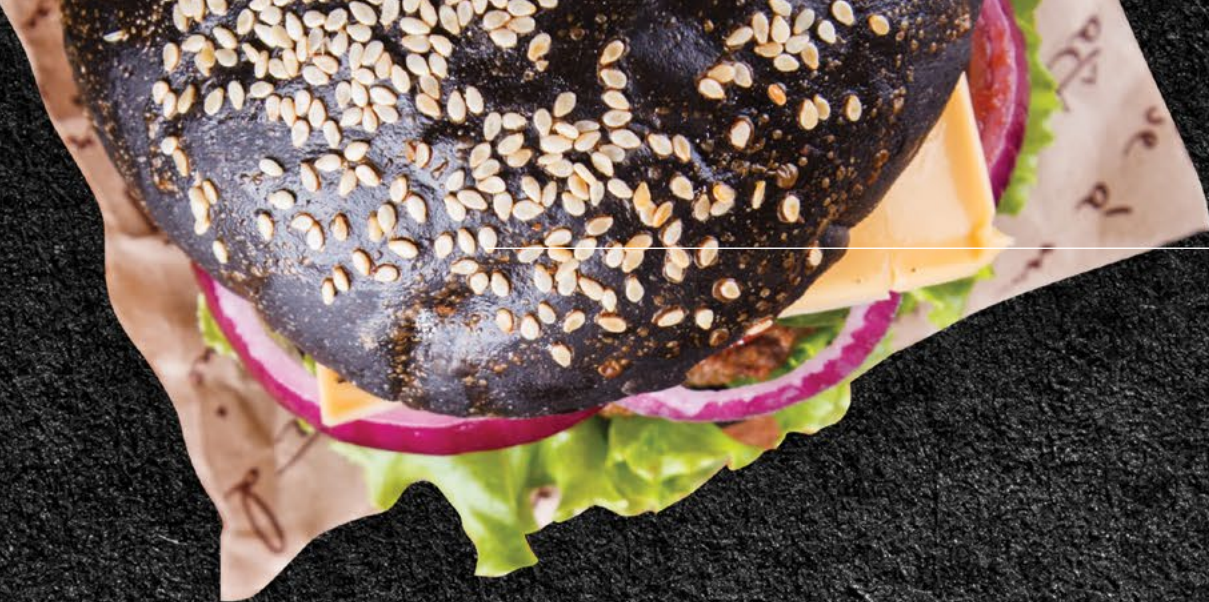
DOUGIES GRILL 150m